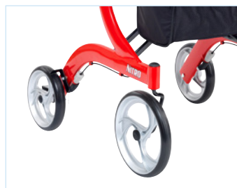
Stylish tri-spoke wheels