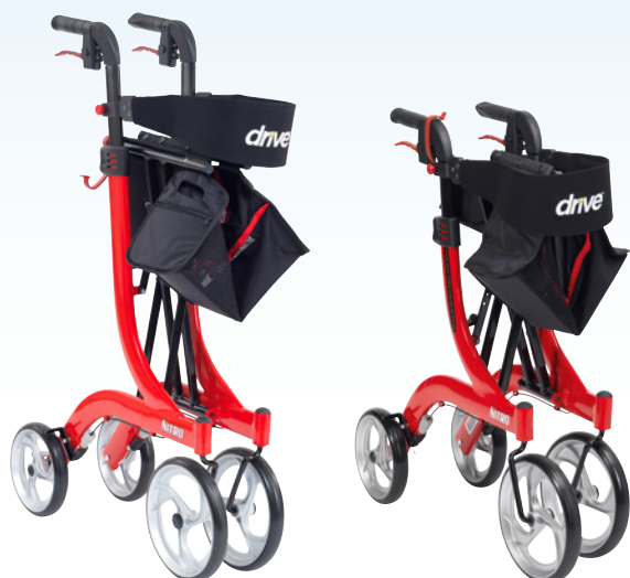
Easily folds with one hand to a compact size for storage and portability

The Nitro Rollators were developed with a contemporary design in mind, featuring a lightweight aluminium frame and stylish tri-spoke wheels for easy manoeuvrability.