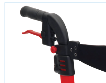
Internally routed brake cables for added safety