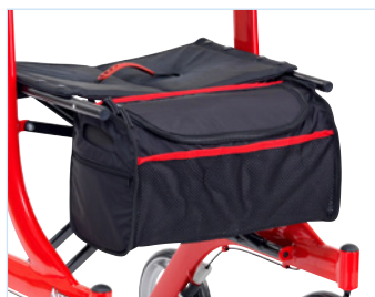
Removable zippered storage bag for storing essentials or shopping