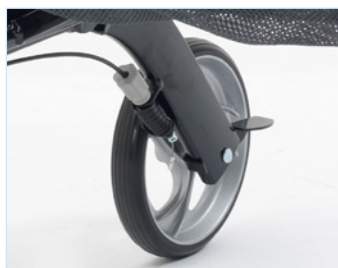
Rear stepper tube facilitates safe curb-climbing